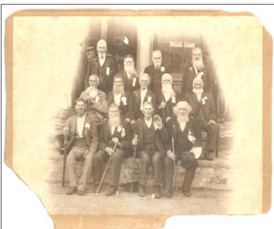
Reunion of Texas veterans of the Battle of San Jacinto